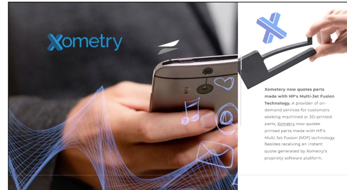
Magazine Display Ad

Note: The R.H.S. black border containing your links & logo will be added by our graphics group.